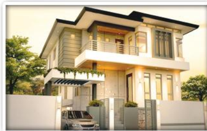
Ready for Construction