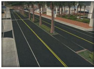
40 ft & 30 ft Black Top Road