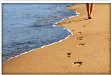
Walkable distance to the Beach