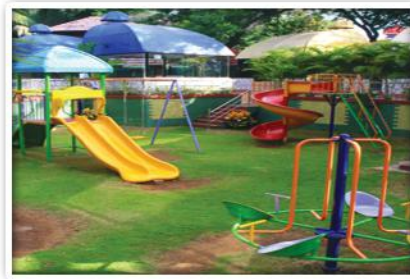
Children Play area