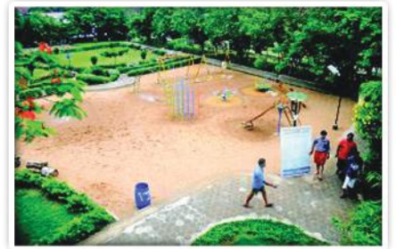
Well Developed Park